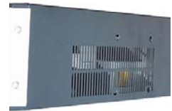
Vent holes on top & sides