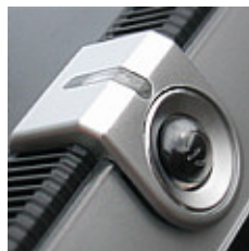
On/Off switch with LED