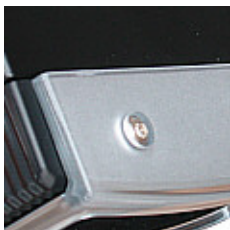
Acrylic Front Panel