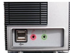
Front USB & Audio