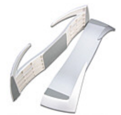
Feet with anti sliding rubber.