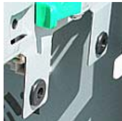
Shock proof HDD grommets