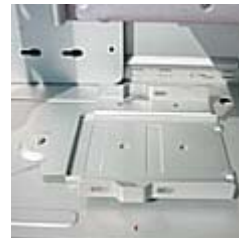
Optional 2 nd HDD bracket.