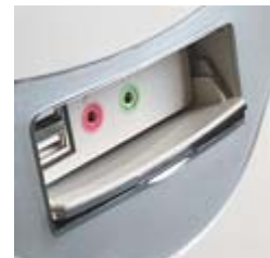
Front USB & Audio