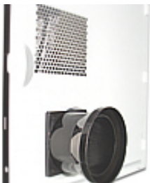
CPU air duct.