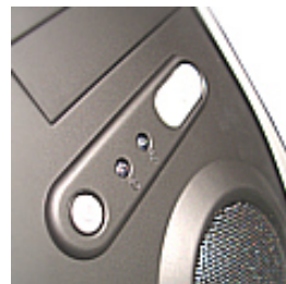
Front Buttons and LEDs.