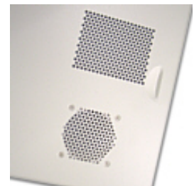
Side vent holes.