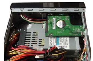
2.5" HDD & PSU (Not included)