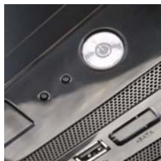
On / Off button