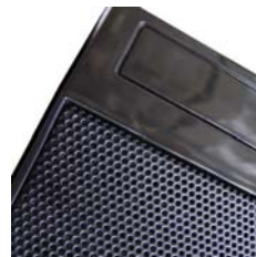
Slim 5.25 Drive