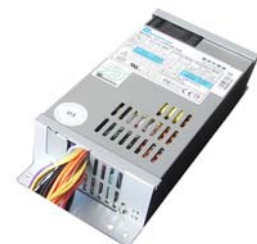
PSU with bracket