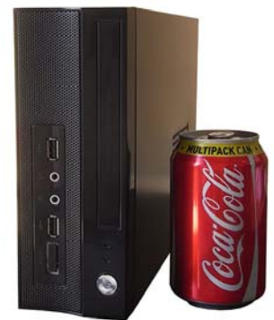
Small chassis. (A4 size)