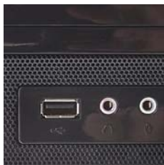
Front USB & Audio