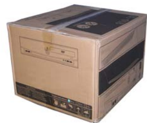
Individual retail packaging 33x41x47cm. 36Pcs / UK Pallet, 24Pcs / Euro Pallet