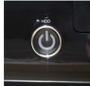
On/Off Button with red LED