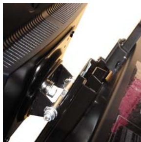
VESA Monitor mount For 19" to 24" LCD monitors