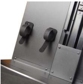
Velcro cable tidy