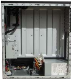
Inside view with PS2 PSU