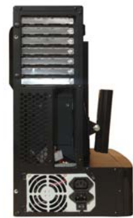
Left view with PS2 PSU