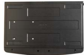
Bottom view with anti-slip rubber feet