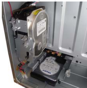
Screwless drives (3x HDD not included)