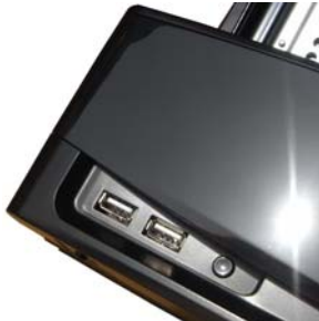
4x Front USB (2 on each side)