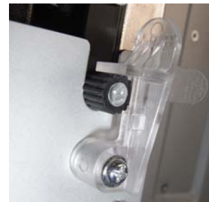
Screwless HDD lock with shock proof rubber mount