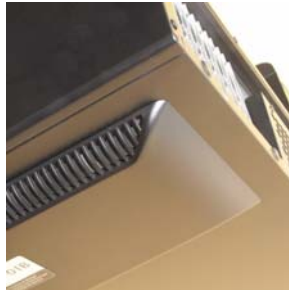
Back vent holes