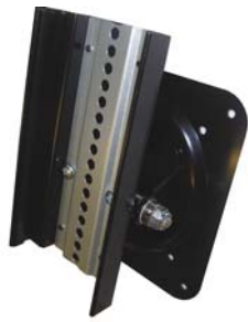
VESA Monitor mount. (Space between screws: 10cm)