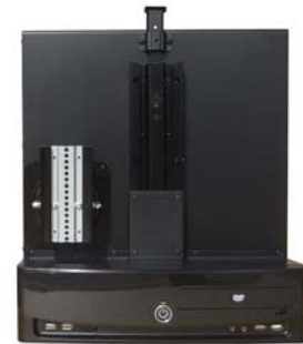
Front view with VESA Monitor mount screwed on chassis for storage